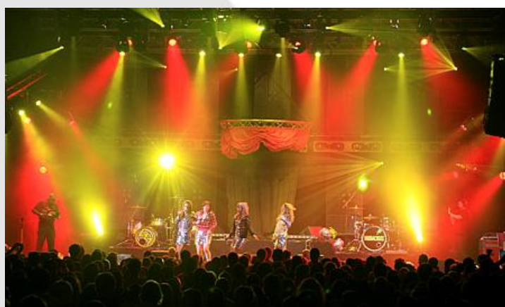
!Audacious Conference and festival style “!Audacious Unleashed”