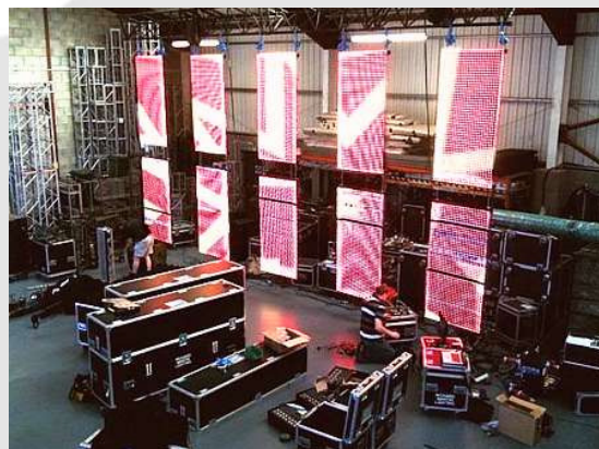
Martin LC panels at the Rock-tech pre-event preparation facility